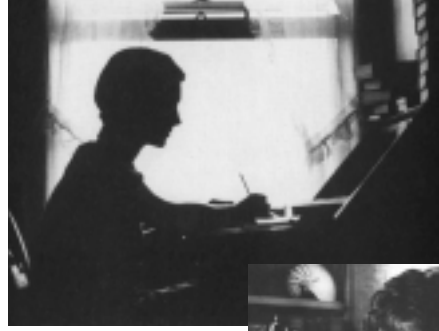
Charles A. Lindbergh