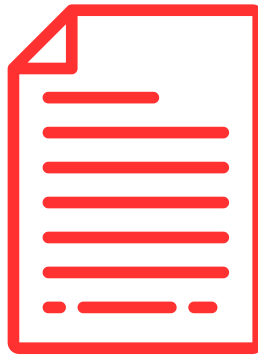
OneAmerica Enrollment Form