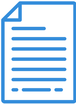
Cigna Enrollment Form

CLICK ON THE LINKED ENROLLMENT FORMS, DOWNLOAD THEM, FILL THEM OUT WITH YOUR ENROLLMENT DECISIONS AND SUBMIT TO HR.