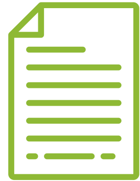
Delta Enrollment Form